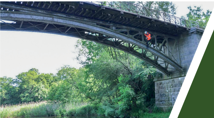
Bridge inspection on Fodsporet performed for The Danish Nature Agency

All accepted papers will be published in the conference proceedings (usb stick), provided that the primary author is present at the conference.