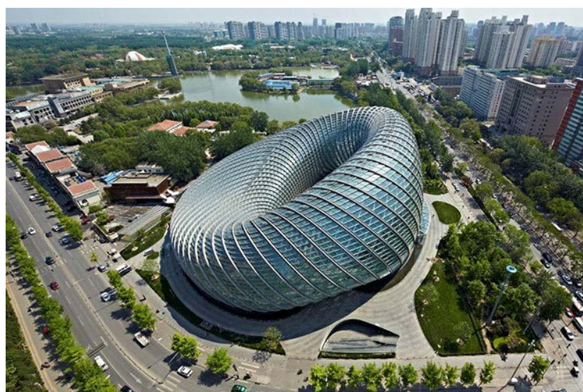
Phoenix Centre, Beijing, China