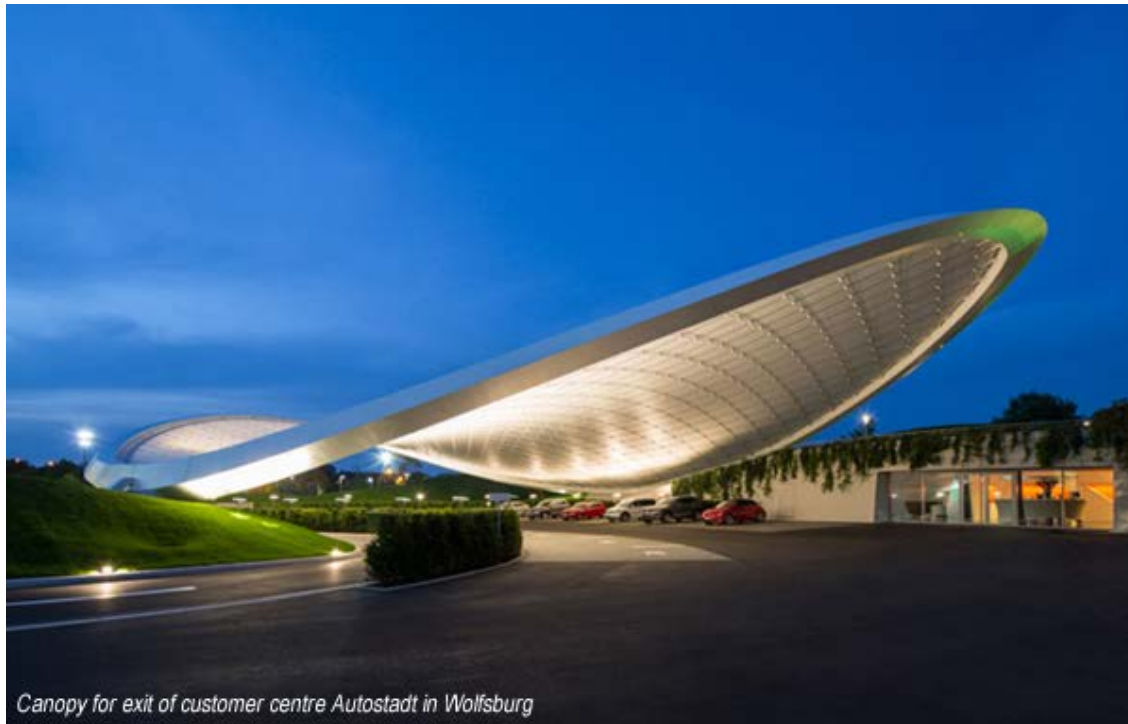
Canopy for exit of customer centre Autostadt in Wolfsburg